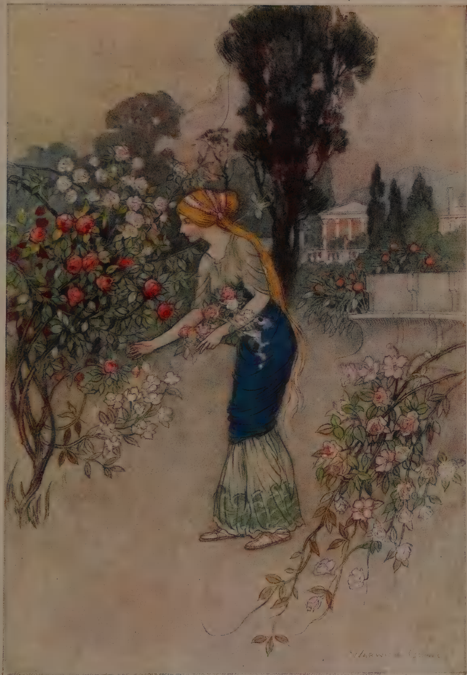
EMILY IN THE GARDEN